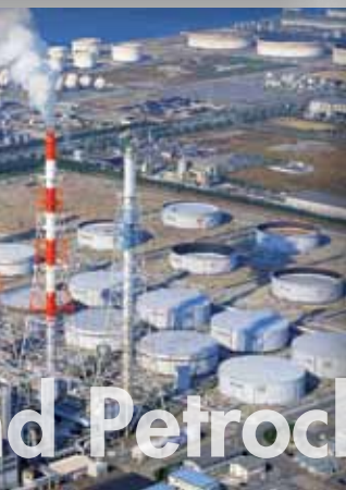
Oil and Petrochemical