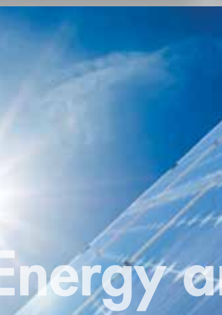
Energy and Power Plant Technology